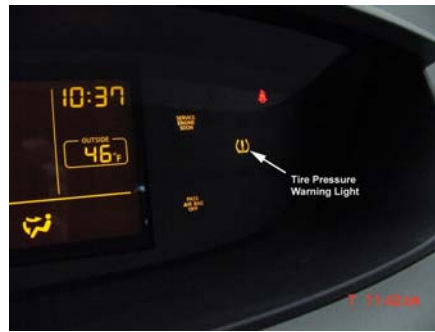
Tire Pressure Warning Light

As an alternative method to relearn Nissan vehicles, a tool has been introduced that is designed to extinguish the Tire Pressure Warning Light on 2003 and newer Nissan vehicles with DLC. It does not reset/relearn changes in tire sensor locations for the vehicle's Body Control Module (BCM). This can be accomplished after the Tire Pressure Warning Light has been extinguished by driving the vehicle at least 30 mpg until the light stops flashing.